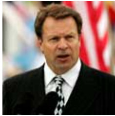
IAAF Council Member and Honorary President of Finnish Athletics, Ilkka Kanerva (photo) is the new Minister of Foreign Affairs of Finland.

Finnish President Tarja Halonen, herself the recipient of the IAAF's highest honour, the Golden Order of Merit (2005), approved the list of proposed ministers on 19 April in a ceremony held in the Finnish capital.