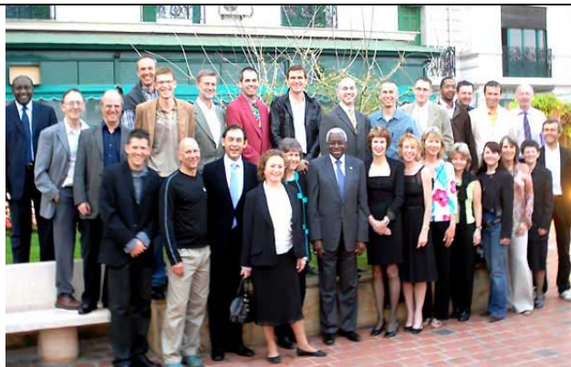
President Diack with IAAF Nutritional Consensus Conference delegates

"This Consensus Statement is an important document for our sport," commented President Lamine Diack. "Not only does it help define and guide the nutritional needs for elite track and field athletes but it also promotes safe and healthy nutritional habits. I strongly encourage all athletes and their support personnel to read both this Consensus Statement and the forthcoming educational products."